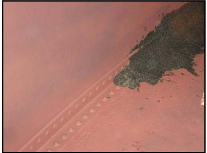
Carboguard 695 PM putty application in chine area