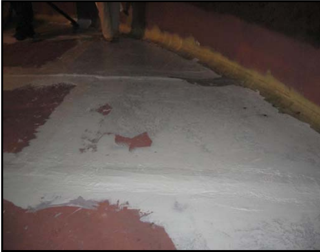
Skim coat of epoxy over pitted steel bottom to “ready” the floor for the clear coat and CSM application