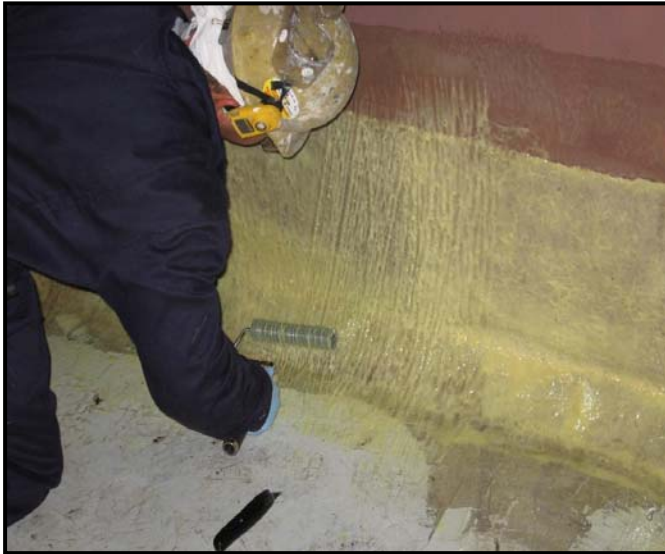
Rolling saturated fiberglass CSM with metal rollers to remove air and install tight to substrate.