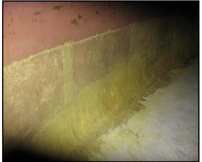
Completed chine area, prior to floor application