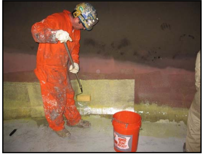
Saturating fiberglass with Carboguard 695 CLR @30 mils using ½ to ¾ ” roller naps