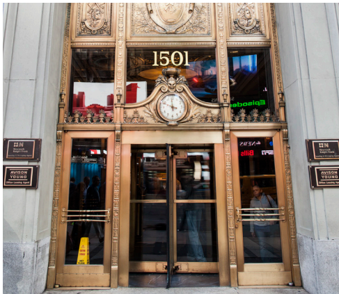
1501 Broadway, New York City